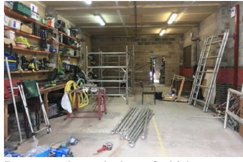
Part-way through the refurbishments