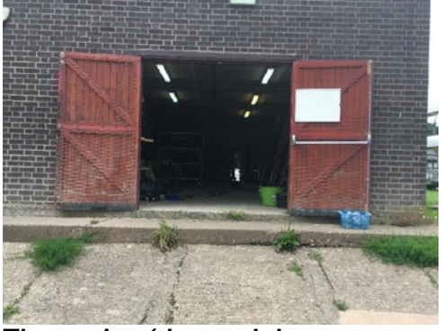
The way in... (the weeds have now been cleared!)