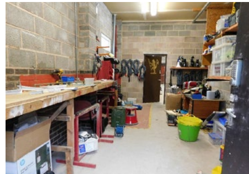
The new workshop