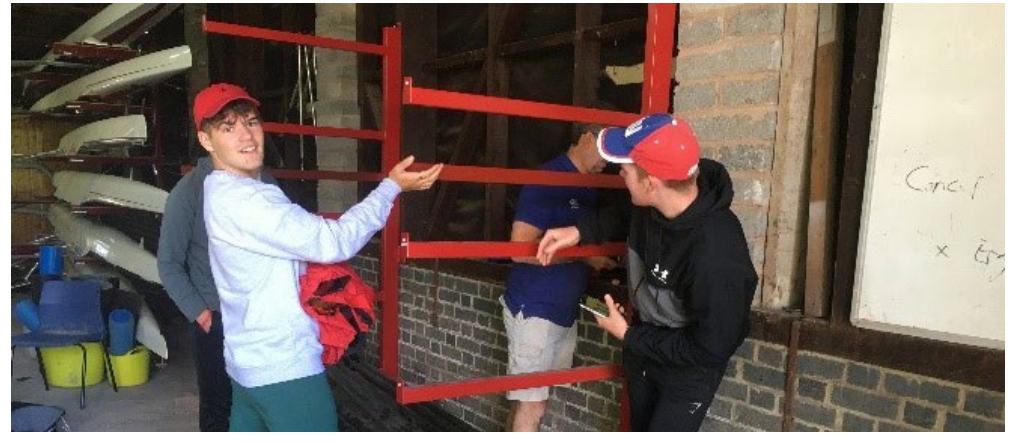
The First VIII lend a hand with the blade racks