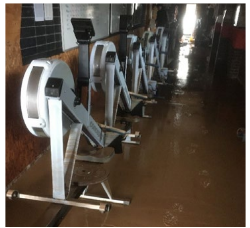
... and then leave.