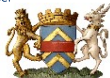
Monmouth Town Council